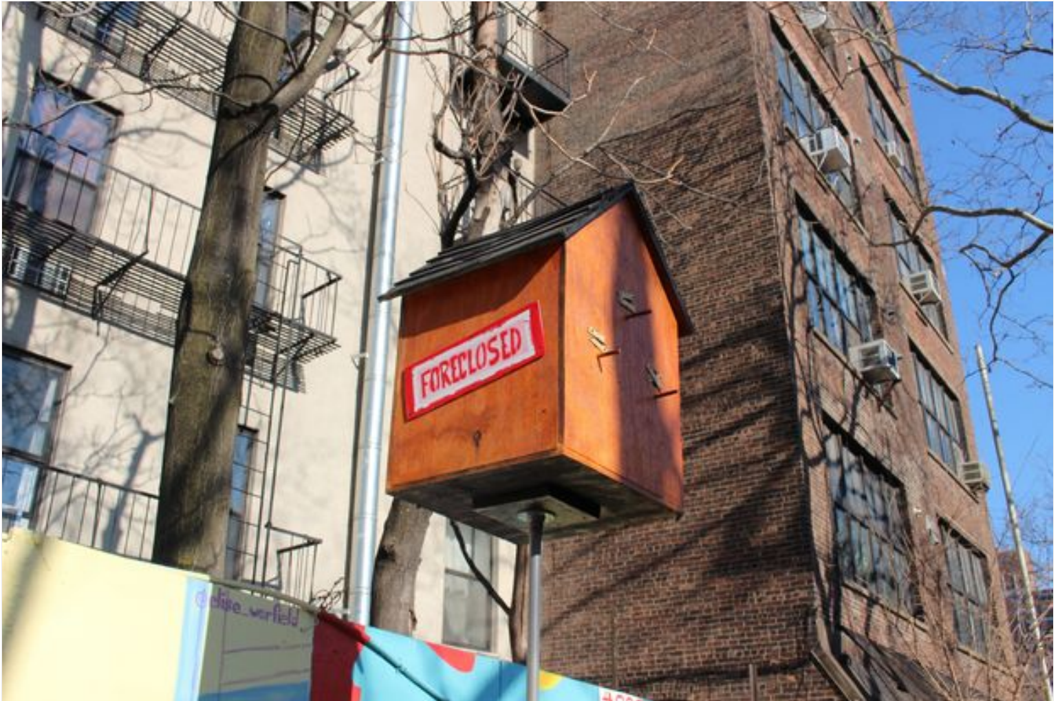
Aaron Schraeter's "Birdhouse Repo" is on display at First Park through June 6.