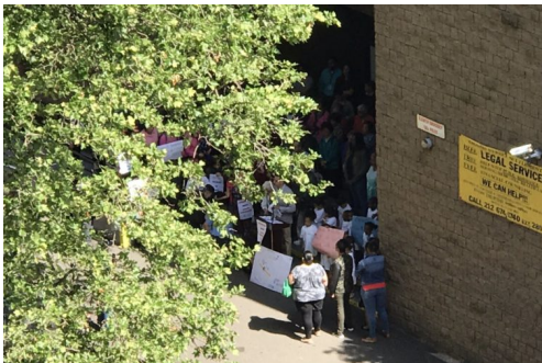
( http://www.boweryboogie.com/2017/06/grand-street-settlement-continues-protest-masaryk-towers-path-closure/ )

A Return to the Madison Street Sinkhole ( http://www.boweryboogie.com/2017/06/return-madison-street-sinkhole/ )