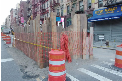
( http://www.boweryboogie.com/2017/06/return-madison-street-sinkhole/ )

'Harold Hunter Day' Turned into a Weekend Festival this Year ( http://www.boweryboogie.com/2017/06/harold-hunter-day-turned-into-weekend-festival-year/ )