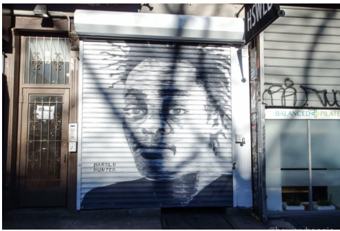
( http://www.boweryboogie.com/2017/06/harold-hunter-day-turned-into-weekend-festival-year/ )

Sport ( http://www.boweryboogie.com/sport/ )